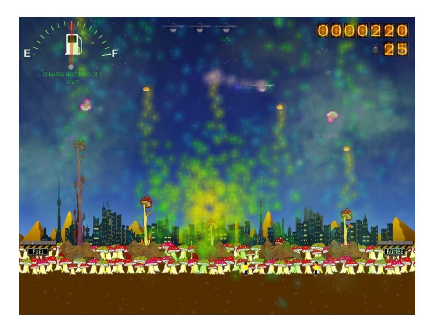
Fungoids - Steam Version Download] [Torrent]

Download >>> <a href="http://bit.ly/2Jnu1aM">http://bit.ly/2Jnu1aM</a>